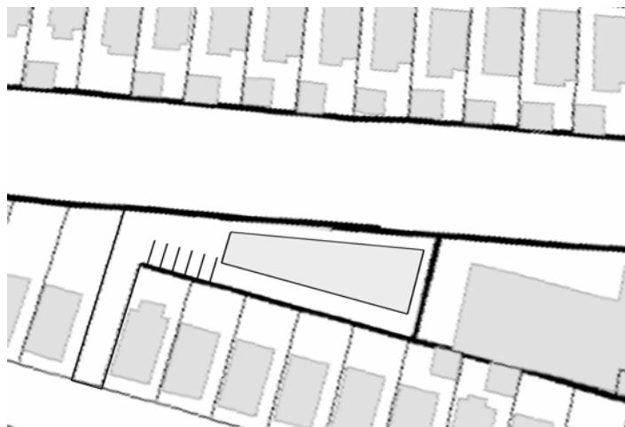
Image of the massing that would be allowed by-right on the site (building footprints – left, looking north and south – below)

Under the current zoning, the developer could build two attached units on the site, but the Planning Board believe such development could be larger, bulkier, more detrimental to the neighborhood and could present a far less appealing appearance along the Community Path. The new building would have to conform to the dimensional requirements of the RA zoning district, including a 2.5 story height requirement but could be as much as 11,156 s.f. in size and up to 35 feet in height. If the applicant elected to build a by right project, the only issues to be reviewed would be building permit and public safety issues addressed by the Inspectional Services Division and Fire Department. There would be no ZBA public hearing, and no direct neighborhood input. Planning staff developed an image that shows the basics of the bulk of what could possibly be built by-right (image below).