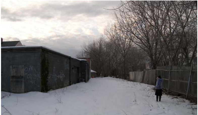
Top: view looking from the northern corner of the site towards the building that will be renovated. Bottom: view from the western corner of the site towards the location of the new structure and driveway.

2. Proposal: The applicant proposes to convert the existing two story structure to a single family residence and add a small addition, for a total of 2,467 square feet of habitable space, and to demolish the existing garage. In addition, the applicant proposes to build a second single-family house of approximately 3,290 square feet, approximately 82 feet from the existing building.