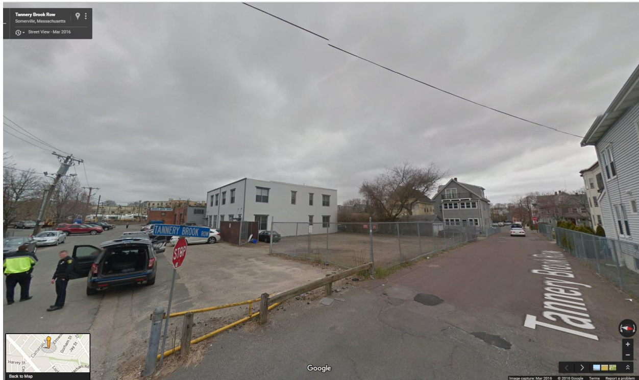
Street view of property