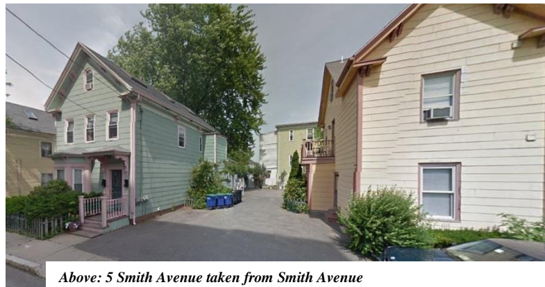
Above: 5 Smith Avenue taken from Smith Avenue

Dates of Public Hearing: December 7, 2016 January 18, 2017