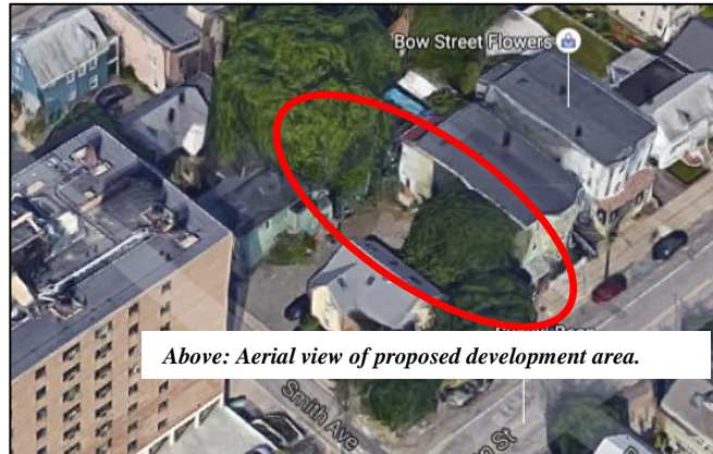
Above: Aerial view of proposed development area.

1. Subject Property: The subject property is an L-shaped 5,227 square foot lot in the RC zone. The property currently contains a c.1869-1874 Italianate 2-family structure on the Smith Avenue side of the lot. The Beacon Street side of the L-shaped lot currently contains two mature cherry trees and various ground cover.