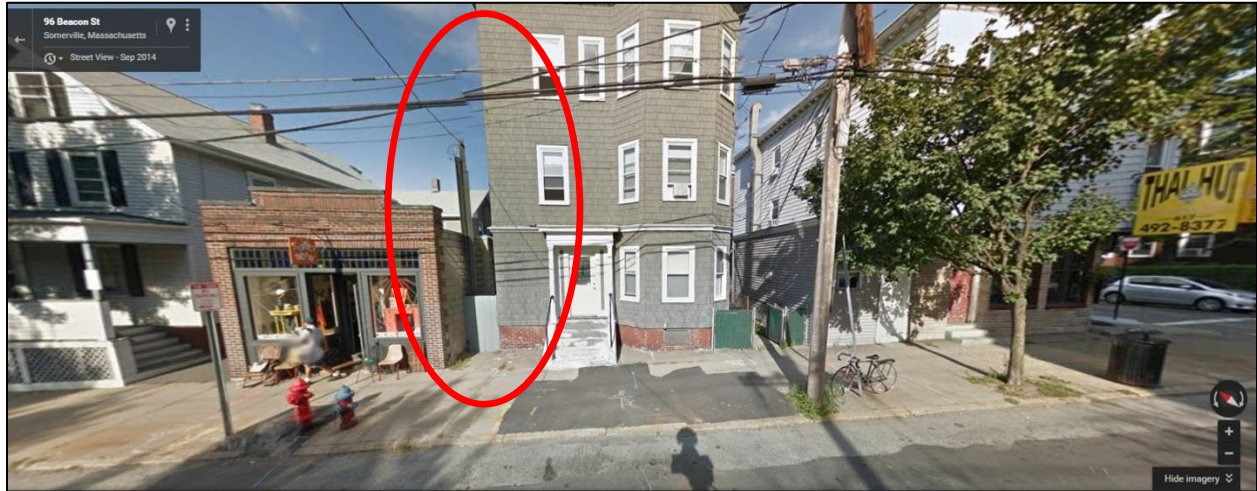
Below: 97 Beacon Street and abutters.

Staff finds that the proposed development would bring residential dwelling unit styles that are compatible with those already present on Beacon Street. As noted earlier, the inclusion of a rear addition to 5 Smith Avenue is consistent with historic building patterns. All of the structures in this immediate area have been two- or more family units since their creating creation in the latter half of the 19 th century. The current proposal does not differ from that trend.