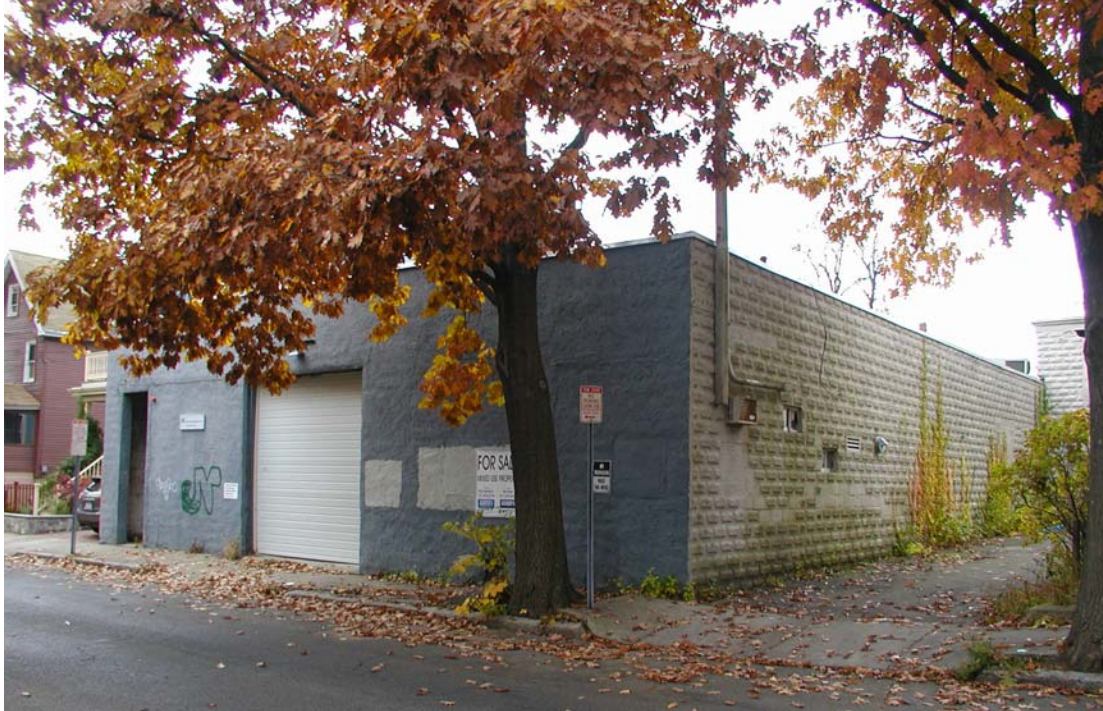
Existing Conditions on Elmwood Street