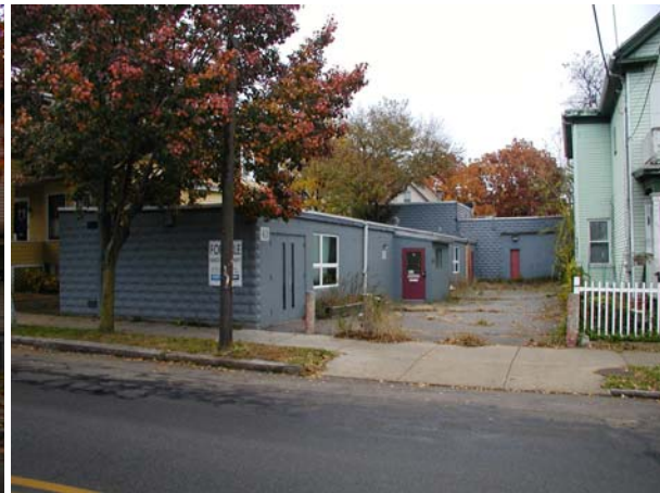
Existing Conditions on Cameron Avenue