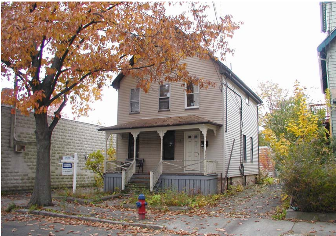
Existing Conditions on Elmwood Street

The Committee did wonder if there is a lot of value to be gained or preserved by retaining the concrete block wall, but this is more likely a fine tuned decision that needs to be worked out between the developer and the neighbors.