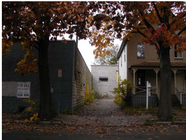
Existing Driveway on Elmwood Street