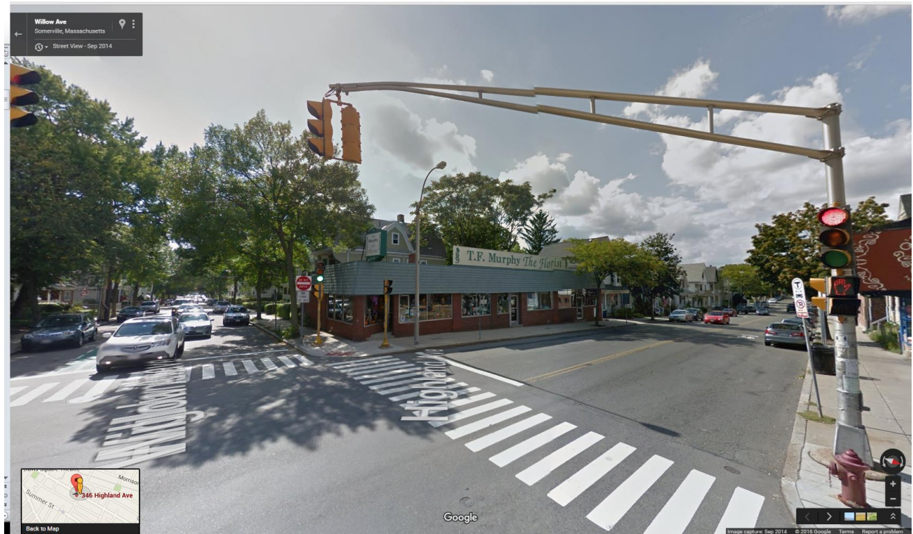
Street view of property