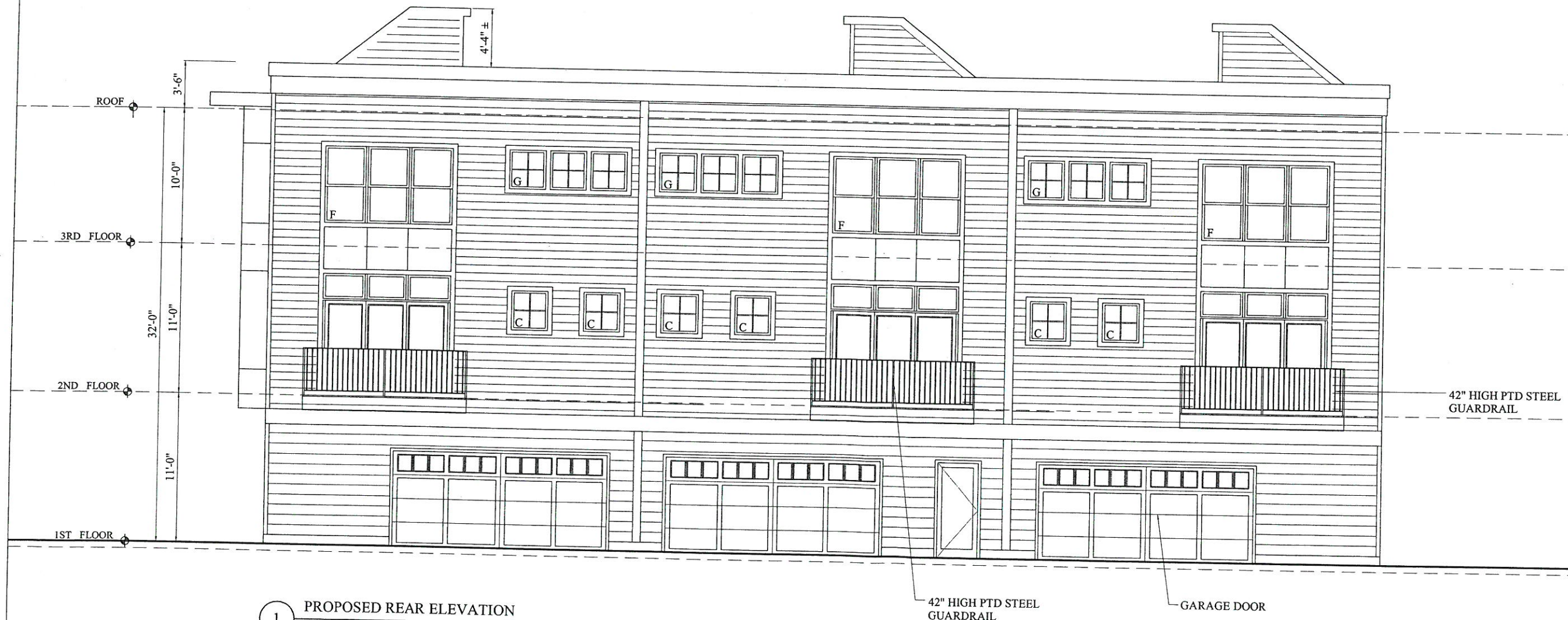
1 PROPOSED REAR ELEVATION 1/4" = 1'-0"