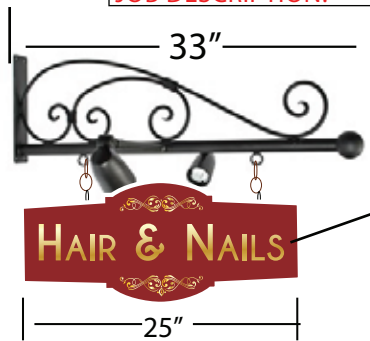
Letters are 23.25" x 3.5" (.6 sq. ft)