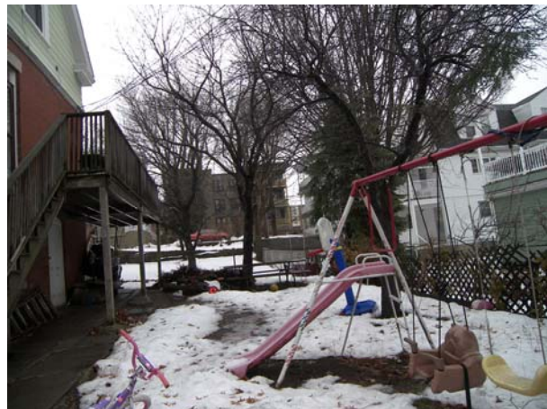
Location of proposed deck- View from driveway

4. Surrounding Neighborhood: The property is located in a Residence A (RA) zone. The immediate neighborhood is predominantly residential, with a mix of one-, two- and multi-family homes.