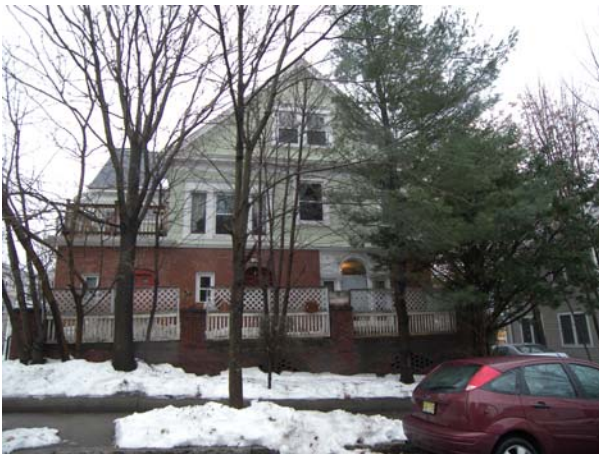
103 Thurston Street - Street View

This existing nonconformity allows the Applicant to apply for a special permits under §4.4.1 of the Somerville Zoning Ordinance (SZO). Section 4.4.1 states: "lawfully existing nonconforming structures other than one- and two- family dwellings may be enlarged, extended, renovated, or altered by special permit authorized by the SPGA in accordance with the procedures of Article 5. The SPGA must find that such extension, enlargement, renovation or alteration is not substantially more detrimental to the neighborhood than the existing nonconforming building. In making the finding that the enlargement, extension, renovation or alteration will not be substantially more detrimental, the SPGA may consider, without limitation, impacts upon the following: traffic volumes, traffic congestion, adequacy of municipal water supply and sewer capacity, noise, odor, scale, on-street parking, shading, visual effects and neighborhood character."