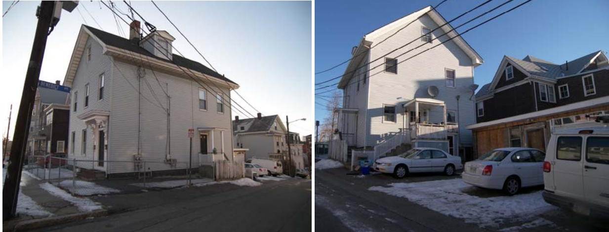
22 Benedict Street: Front/Side (left), Back Porch Location (right)

2. Proposal: The proposal is to construct a two-story, 17.5' by 12.5', addition in the rear of the dwelling. Due to the slope of the site, the first story would be at the basement level and it would be used for storage. The second story of the porch would be enclosed and would align with the first story of the house. The Applicant has previously submitted drawings that were difficult to read and contained errors, and Staff had recommended Denial. In consultation with Staff, the Applicant has submitted revised drawings that are a significant improvement. These illustrate a three-foot space between the addition and the existing garage, which would provide access to the side yard and allow maintenance of the structures. The new drawings show the porch covering a portion of an existing window, which the Board recommends requiring it to be replaced with a smaller window or filled in. The revised drawings also illustrate a sloped roof over the new porch, which is an improvement. A small portion of the stairway would be located outside the structure, with the remaining stairs located inside. Staff has created the following image to illustrate the spatial relationship of the porch to the garage.