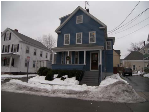
64 Berkeley Street - Street View

These existing nonconformity allows the Applicant to apply for a special permits under §4.4.1 of the Somerville Zoning Ordinance (SZO). Section 4.4.1 states: "lawfully existing one- and two- family dwellings which are only used as residences, which are nonconforming with respect to dimensional requirements, may be enlarged, extended, renovated, or altered by special permit granted by the SPGA in accordance with the procedures of Article 5, when any such enlargement, extension, renovation or alteration increases the nonconforming nature of the structure or the Gross Floor Area of the dwelling is increased by more than twenty-five percent. The SPGA, as a condition of granting a special permit under this Section must find that such extension, enlargement, renovation or alteration is not substantially more detrimental to the neighborhood than the existing nonconforming structure."