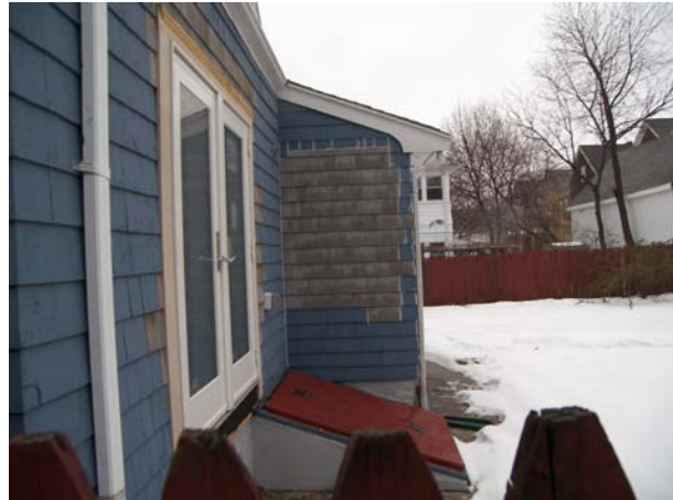
Location of proposed deck from abutting driveway (over fence)

4. Surrounding Neighborhood: The property is located in a Residence A (RA) zone. The immediate neighborhood is predominantly residential, with a mix of one-, two- and three-family homes.