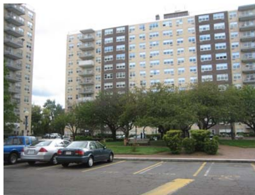
Location of proposed landscaping (l), Location of proposed building (r)

3. Nature of Application: The site is currently nonconforming with several dimensional requirements, including landscaped area, lot area per dwelling unit, building height, and side yard setbacks.