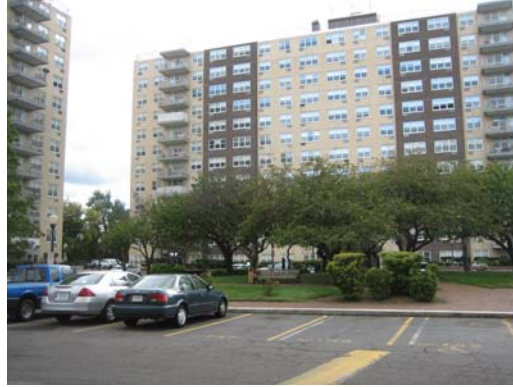
Location of proposed landscaping (l), Location of proposed building (r)

3. Nature of Application: The site is currently nonconforming with several dimensional requirements, including landscaped area, lot area per dwelling unit, building height, and side yard setbacks.