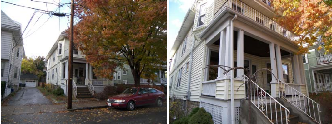
28 Burnham Street: existing front porch (above), 34 Burnham Street: style of porch proposed (below)