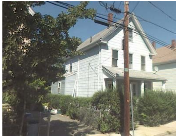
7 Harrison St – front (l), rear (r)

3. Nature of Application: The structure is currently nonconforming with respect to several dimensional requirements, including lot area, front and side yard setbacks. The proposal affects the nonconforming side yard setback, which is 3.6 feet; the minimum side yard setback is 7.16 feet. This existing nonconformity requires the Applicant to obtain a special permit under §4.4.1 of the Somerville Zoning Ordinance (SZO).