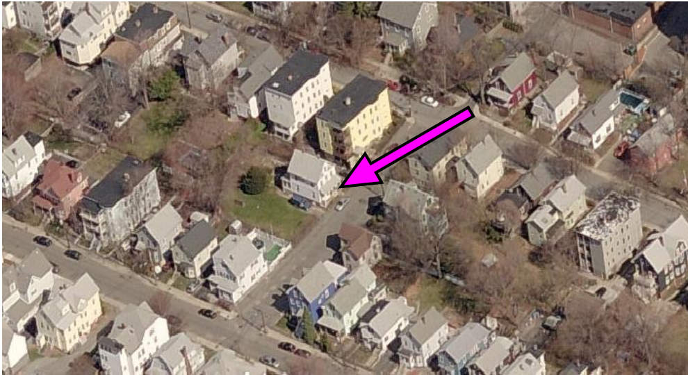
Birds eye view of 10 Hersey Street

Proposal: The Applicant is proposing to construct a two-story addition to the rear of the house, increasing the usable living space by approximately 230 square feet. The addition would expand the basement, add a roof over the staircase to the basement, replace an enclosed porch with a bathroom on the first floor, and expand two bedrooms and add bathroom on the second floor. The rear portion of the addition would have a gable roof that matches the pitch of the existing front portion. Also, the new clapboard will match the existing siding materials and the new portion of the roof will use shingles that match the existing roof.