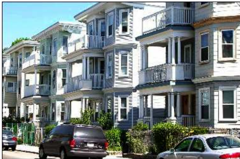
Generic triple-decker houses

originally had more than a ground floor entry porch. The return of the porches, themselves will give the building more of the presence the developers of the triple-decker intended. The simple generic rail, post and baluster style indicates that these elements are not original to the building but that they are replacing what should have been there.