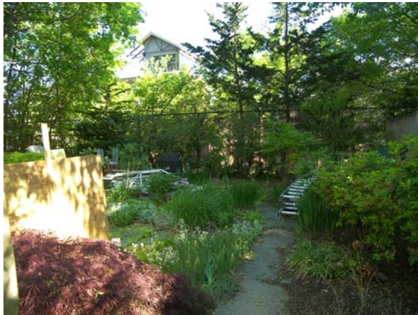
Back yard abutting community path