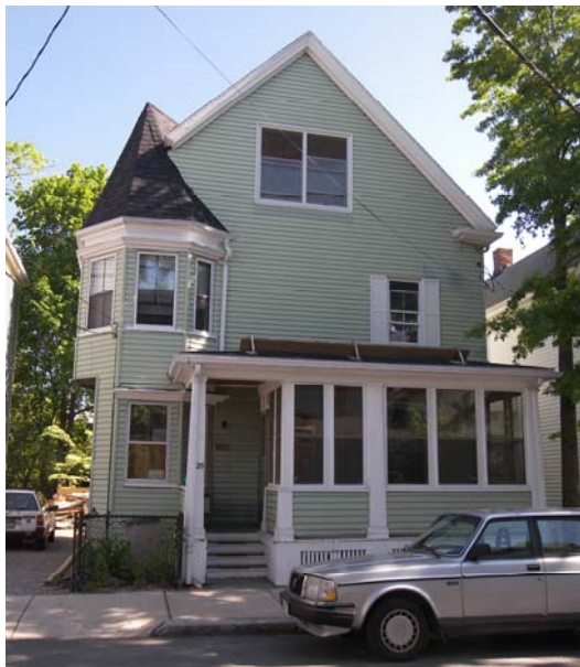
25 Kingston Street: Front

3. Nature of Application: The structure is currently nonconforming with respect to dimensional requirements. The proposal impacts the nonconforming side yards which are 1.6 and 7.5 feet. The minimum side yard setback in this district is 8 feet. These existing nonconformities require the Applicant to obtain special permits under §4.4.1 of the Somerville Zoning Ordinance (SZO). Section 4.4.1 states that “[l]awfully existing one- and two-family dwellings which are only used as residences, which are nonconforming with respect to dimensional requirements, may be enlarged, extended, renovated or altered by special permit granted by the SPGA in accordance with the procedures of Article 5.”