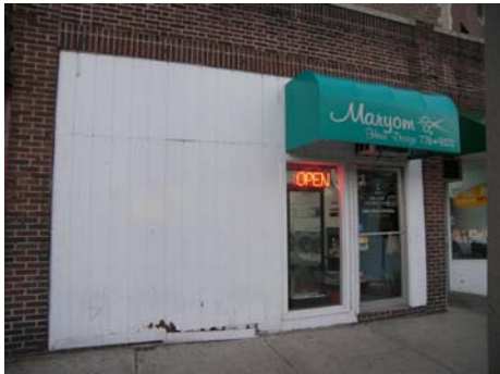
Existing storefront and adjacent vacant store