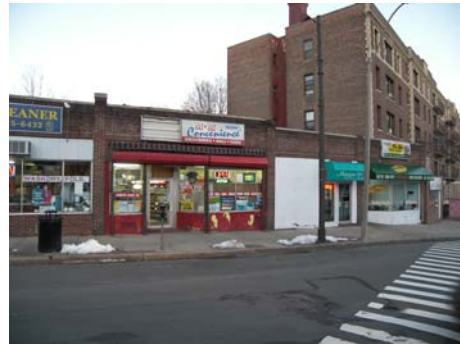
Subject building from Broadway

3. Nature of Application: The Applicant is requesting a special permit under SZO §4.4.1 to allow the alteration of a nonconforming single-story commercial structure. The Applicant is proposing to expand their salon operation into the adjoining store and combine the storefronts. The site and structure are nonconforming with respect to parking, landscaping, and sideyard setbacks. The alterations to the building façade will not affect the nonconforming aspects of the building.