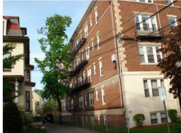
Abutting properties to 126 Orchard Street (above) Trees in back yard (below)