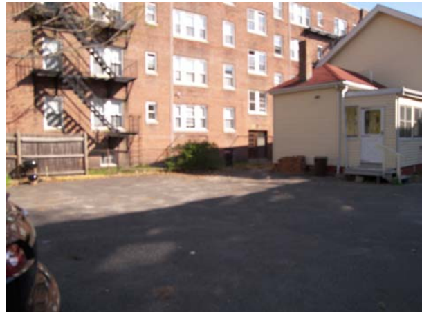
126 Orchard St: L – front, R- back yard

3. Nature of Application: The structure is currently nonconforming with several dimensional requirements, including minimum lot size, side yard setback, landscaped area, and street frontage. A 3-unit dwelling is a by-right use in an RB district. The lot area per dwelling unit dimension would remain conforming. The Applicant has stated that the landscaped area will increase and be above the 25% requirement; this must be verified in a final landscaping plan prior to issuance of a Certificate of Occupancy.