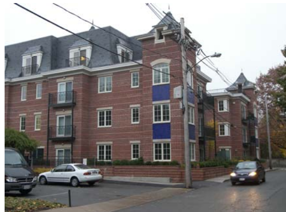
Applicant's driveway and abutting apartment building