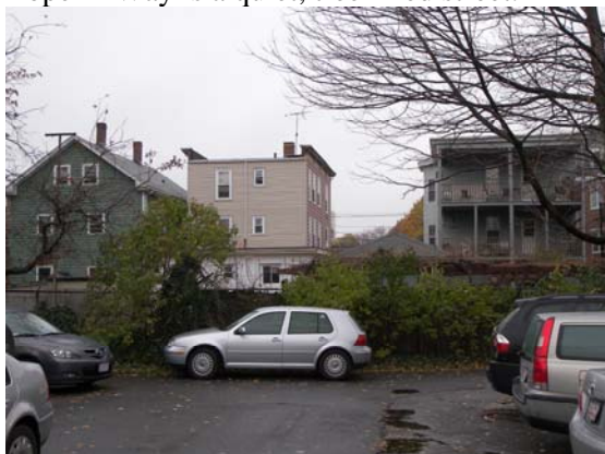
Applicant parking lot and abutting residential homes

5) Surrounding Neighborhood: The immediate neighborhood is predominantly residential with a mix of single, two-, and three-family, wood homes to the rear and north of the structure. Abutting the property to the south and across the street are large, four-story brick apartment buildings that are well maintained. These buildings have brick walls, which enclose landscaping and have been built up to the street wall. The street layout in the area is an irregular pattern which creates a quiet and relatively traffic free neighborhood. Properzi Way is a quiet, tree lined street.