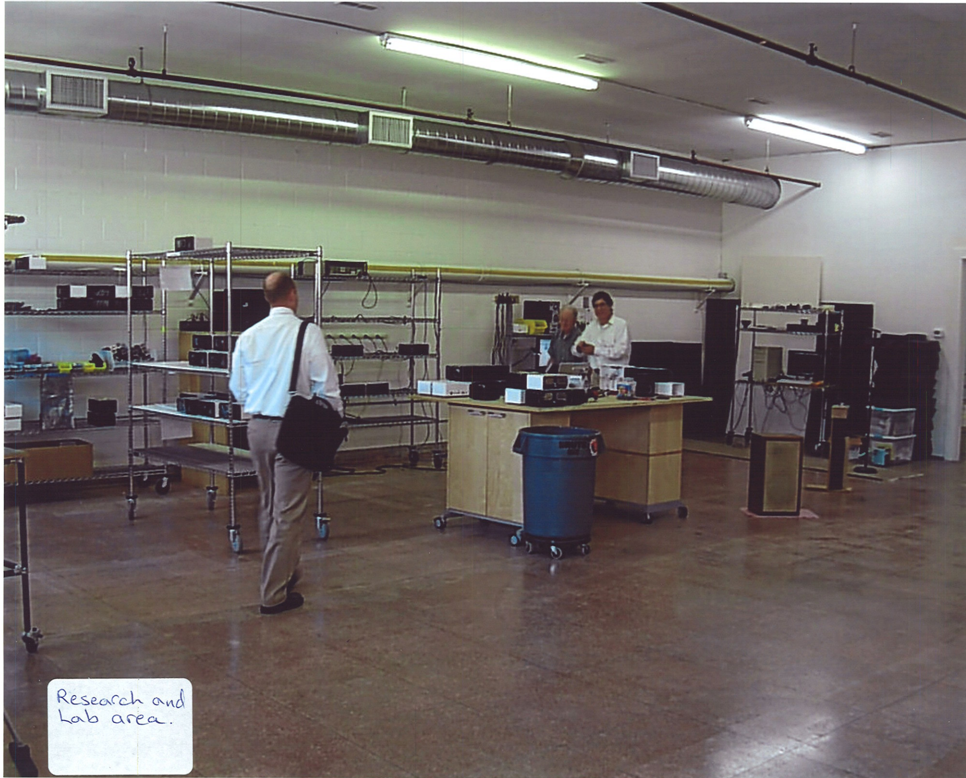
Research and Lab area.