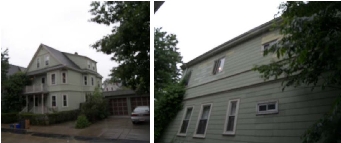
5-7 Spencer Ave.: (L) Front/Right Side of House, (R) Left Side of House – proposed location of dormer

2. Proposal: The proposal is to construct a shed dormer on the left side of the house to create headroom for the construction of a closet, bathroom and laundry room. The length of the dormer would be 20' 2", just less than fifty percent of the roof's length. The dormer would be roughly centered within the length of the roof. The Applicant has reconfigured the windows on the dormer so that they are all the same size and account for a significant portion of the dormer's front wall face. The pitch of the dormer would be steep and match that of the dormer on the right side of the house. The siding of the dormer would be singles to match the house.