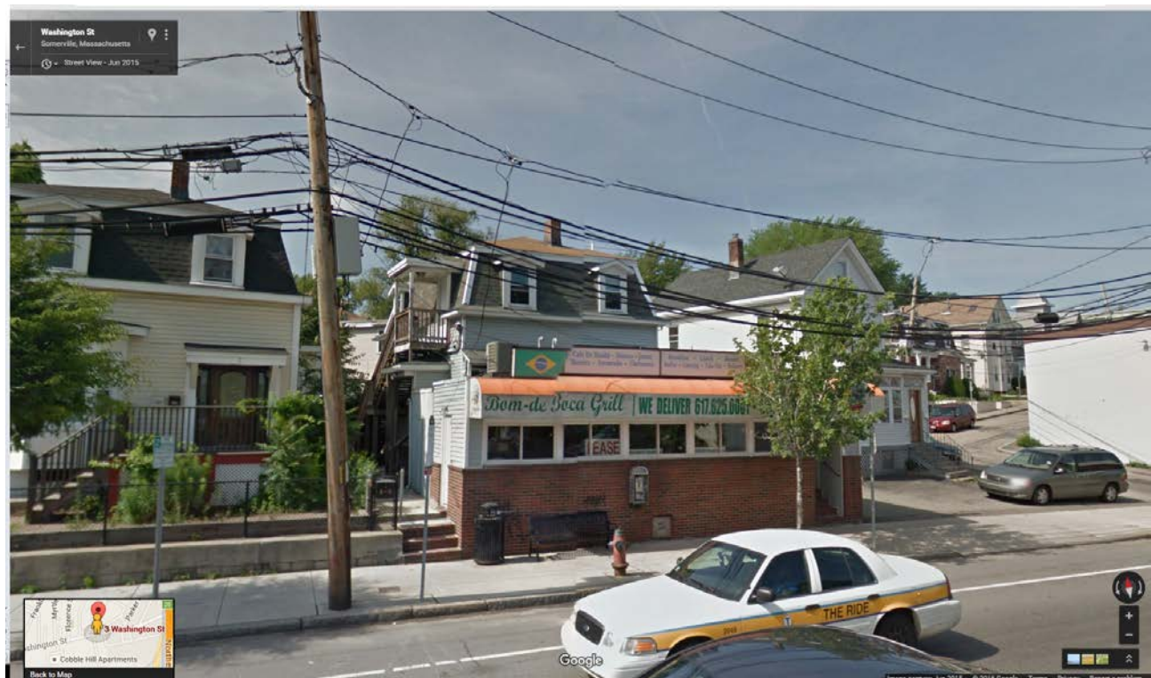
Street view of property