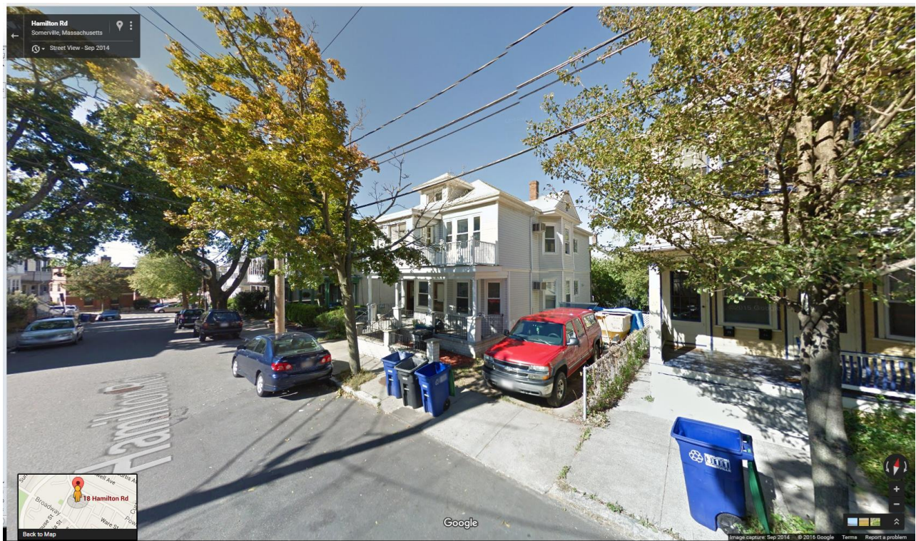
Street view of property