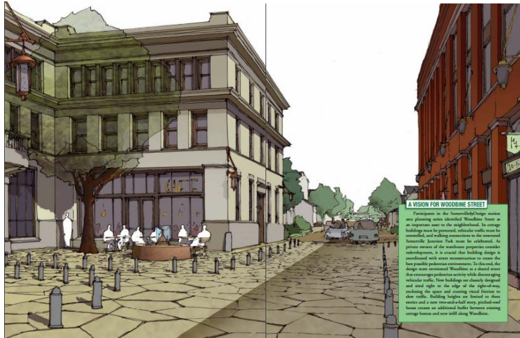
Rendering of 231 Lowell Street (building on the left) and potential future redevelopment of 229 Lowell Street (building on the right) with Woodbine Street as a shared street in between

The current proposal includes three separate buildings with underground parking which are key elements for the site in the neighborhood plan. The proposal also includes a forecourt and creates a portion of the shared street envisioned for Woodbine Street that is under the control of the applicant.