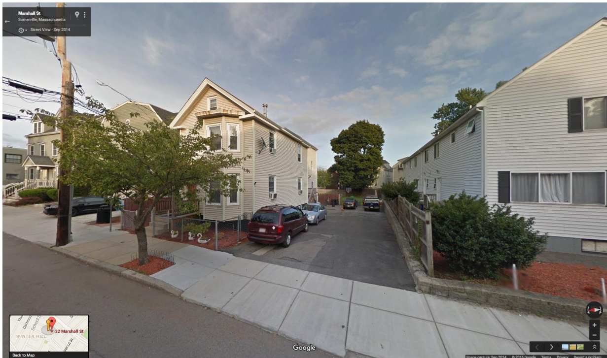
Street view of property

Ward Alderman: Alderman has been contacted.